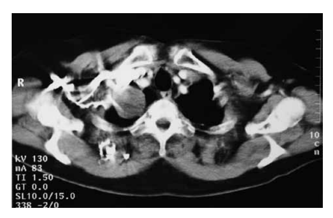
FIGURE 2. Computerized tomography image of the tumour.

was no palpable cervical mass but the neurological examination revealed paraesthesia and loss of strength in the right hand, with an ulnar distribution, raising the possibility that the symptoms in the extremity were caused by a compression of the T1 nerve root. It was decided to perform resection of the tumour.