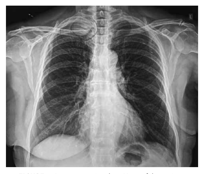
FIGURE 1. Anteroposterior chest X-ray of the patient.

On physical examination the patient was stable. There